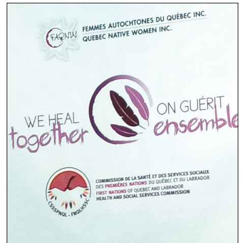
First Nations Forum on Sexual Abuse

From March 27th to the 29th, I had the chance to attend the First Nations Forum on Sexual Abuse organized by Quebec Native Women at the Plaza Hotel in Quebec City. More than 120 people attended this event, where a total of 27 communities were represented. Several topics on various forms of violence against women and children in communities were discussed. Through workshops, we developed an action plan to combat sexual assault in communities. It will be presented to the Chiefs' table for approval.