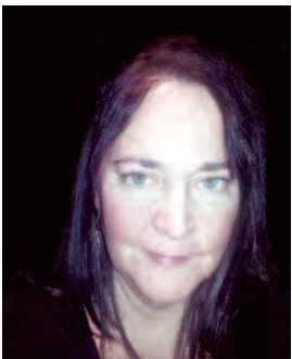
Florence Benedict Councilor

Kwai, Five months have passed since the last election. Pending files are going well and we are progressing slowly but surely.