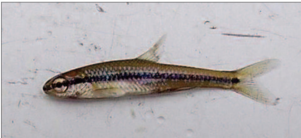
Adult Bridle Shiner