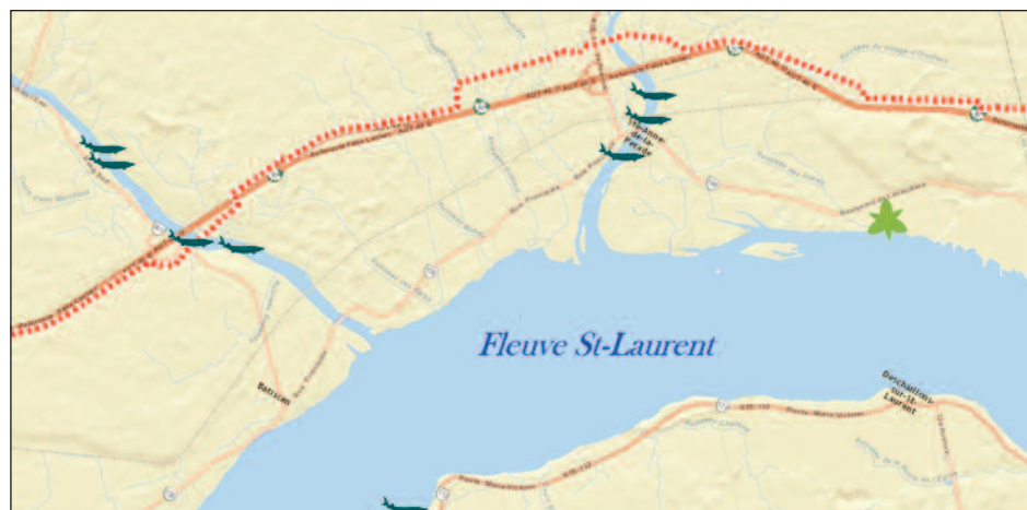
View of the map showing Batiscan (left) and Sainte Anne (right) rivers' mouth. In addition to fishing sites, this map depicts a harvesting site.

Over the last few months, much has been said and written about the Energy East project by the Alberta-based company TransCanada. The project to install a pipeline to transport oil from western Canada and the US to the provinces and refineries in the East, and ultimately allow the export by sea, has become increasingly controversial in Quebec. Since its setbacks in Cacouna, where a deep-water port project was canceled due to the presence of critical habitat for the beluga, an endangered species, opposition to the project has continued to grow.