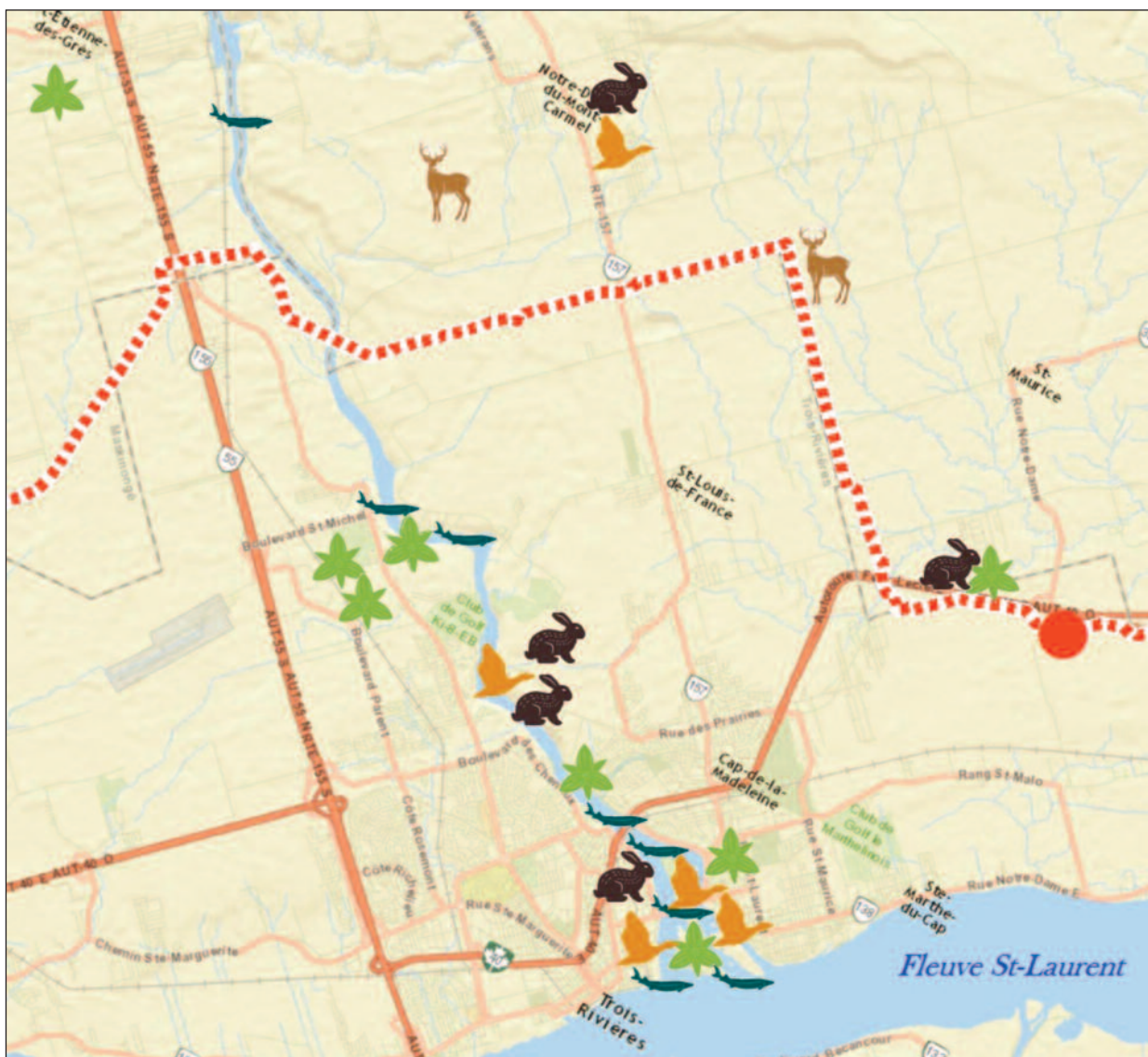
View of the map showing the Saint Lawrence River and the Saint Maurice river's mouth. This map depicts a number of sites visited by Abenaki members for their subsistence, ritual and social activities. The white tailed deer represents big game, the hare corresponds to small game while the goose indicates waterfowl hunting.

For further information on the project, on the importance of the consultation process or any other related issue, feel free to contact us or visit us at the Grand Conseil de la Nation Waban-Aki.