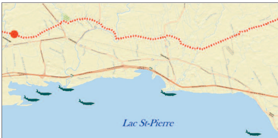
View of the map showing the Lake Saint-Pierre's north shore. The red dotted line corresponds to the pipeline planned route, the red dot represents a pump station and fish are fishing sites visited by Abenaki members.